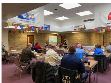
Pictured: Training session to learn more about 211 and cybercrime.